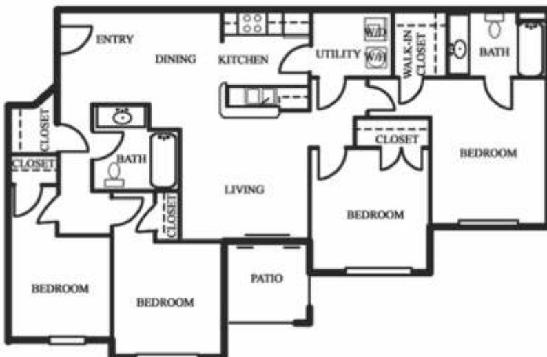
4 Bed / 2 Bath 1,354 Sq. Ft.*

2450 E. Berry St. South, Fort Worth, TX 76119