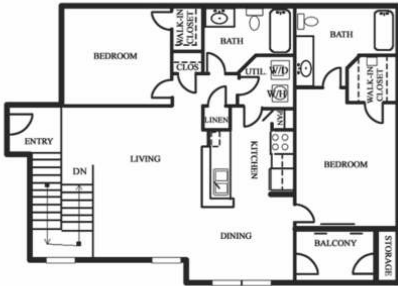
2 Bed / 2 Bath 990 Sq. Ft.*